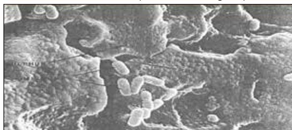
Thiobacillus bacteria attached to Sulfur